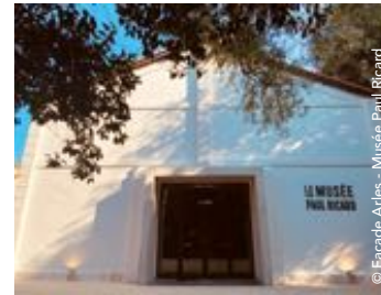
Musée Paul Ricard