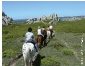
The Petit Roman