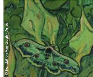
Fondation Van Gogh