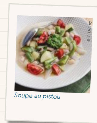
Soupe au pistou