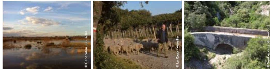
Sentier Homme et Nature