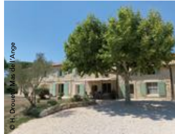
Mas de l'Ange