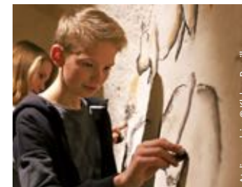
Atelier scolaire