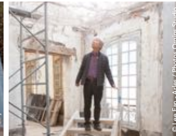
Fondation Lee Ufan